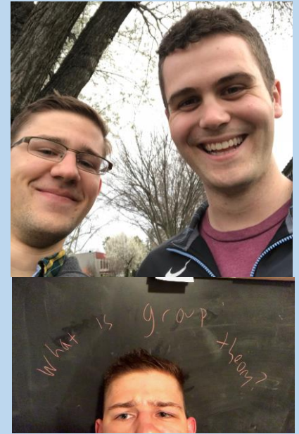
Then (Top) and now (bottom): My first visit to Davis preceded a flurry of trips to Irvine, CA and all rounds of the NCAA Men's Basketball Tournament. Now I'm hunkered down here for a while!

While there have certainly been a few unexpected bumps here and there, my experience so far has confirmed my first impressions. Davis is a cool town, my new friends are supportive and interesting, and I'm (begrudgingly) stimulated by the coursework. I'll continue to grow here.